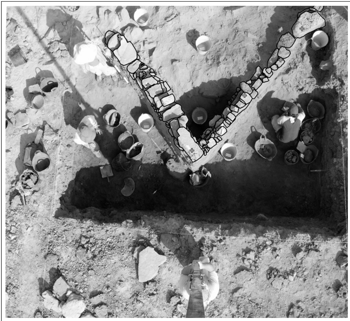
Figure 2. Photograph of Area M at Khirbat en-Nahas, 2006, showing person holding the Boom pole. Part of rock drawing made using ArcMap is superimposed on the corner of the building.